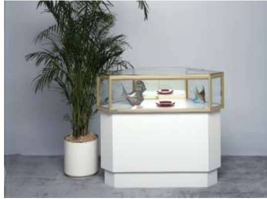
Corner Quarter Vision