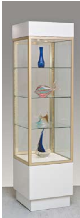
White / Gold