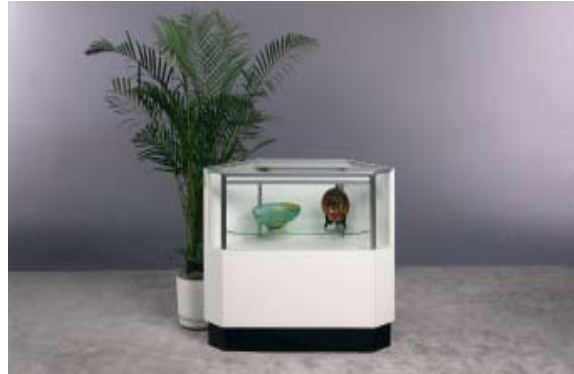
Corner Half Vision