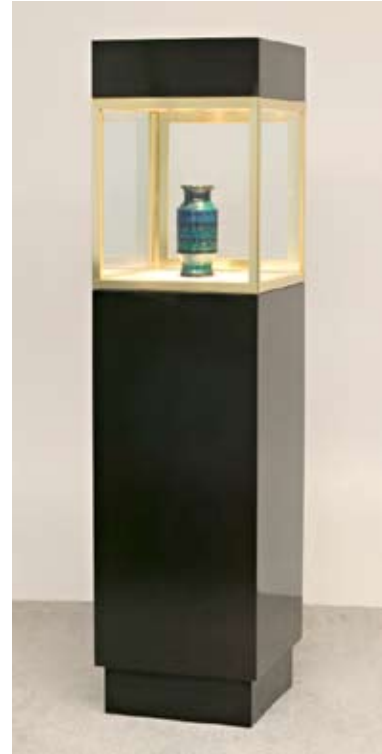
Black Museum Case