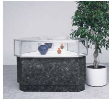
Corner Quarter Vision