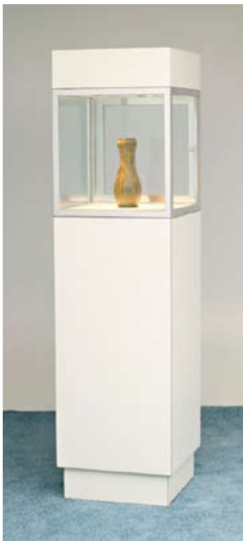
White Museum Case