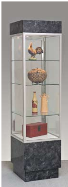
Marble Black Tower