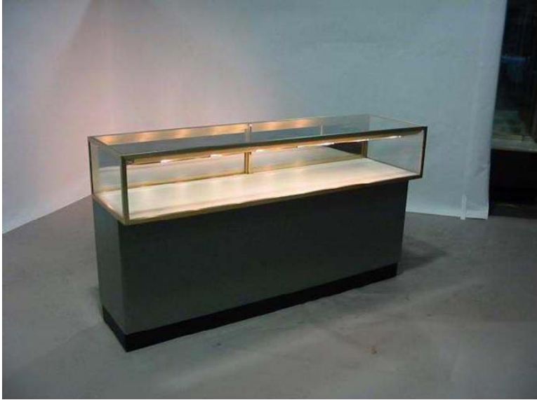
Quarter vision shown above

SHOW: IECSC New York LOCATION: Jacob K. Javits Convention Center DATE: March 7-9, 2010